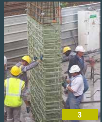
DURGLASS® cage for piles