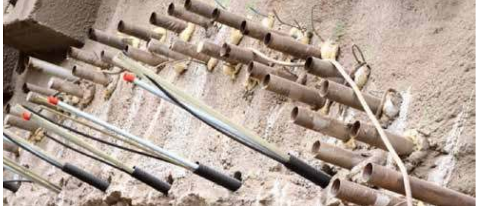
Portal with DURGLASS® glass fiber bolts

DURGLASS® glass fiber bolts are used for the reinforcement of the excavation front of tunnels with traditional methods. Combined with DURVINIL® sleeved grouting pipes, they improve the mechanical properties of the soil before excavation.