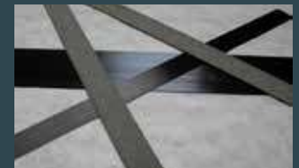
Column reinforcement by means of CARBOPREE® fabric