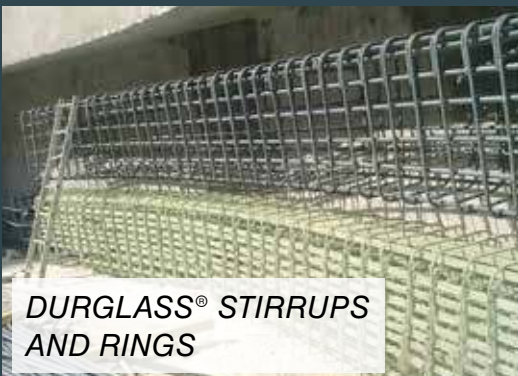
DURGLASS® STIRRUPS AND RINGS