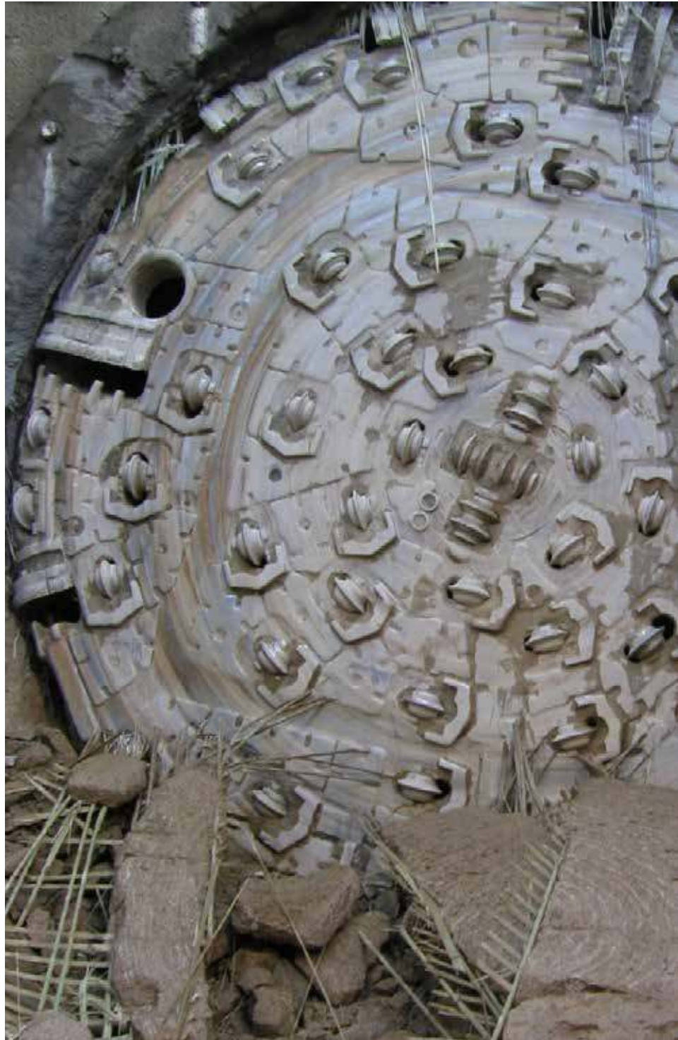
Crossing of DURGLASS® glass fiber reinforced piles

Nowadays the Soft-Eye technique is used in several projects all around the world and it is applied not only for diaphragm walls, but also as reinforcement for piles and for complex concrete structures.