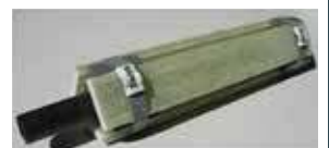
DURGLASS® STRUCTURAL ELEMENTS for the reinforcement of tunnels excavation front