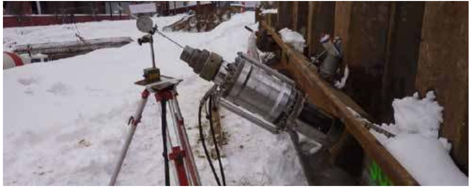
Stretching of a DURGLASS® anchor

Where there is a need not to let any metal elements in the soil, due to local restrictions or future projects of subways, DURGLASS® glass fiber anchors are the right solution to project constraints.